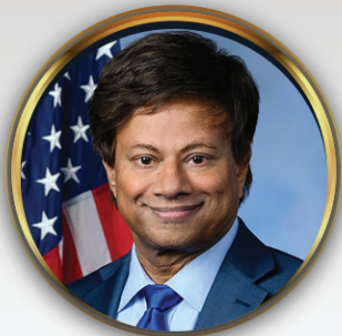
U.S. Rep Shri Thanedar