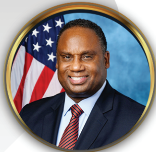
U.S. Rep Jonathan Jackson