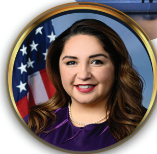
U.S. Rep Delia Ramirez