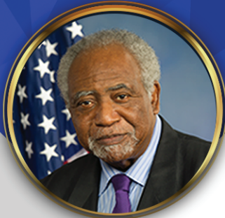
U.S. Rep Danny K. Davis 7th CD- IL