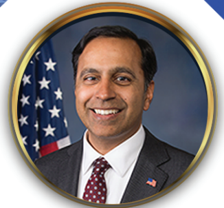
U.S. Rep Raja Krishnamoorthi

HONORING TOP 20 GLOBAL WOMEN OF EXCELLENCE