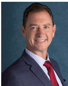
Honorable Major Drew Boyles

Major of the City of El Segundo, California, USA.