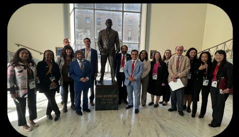
Brain Mapping Day