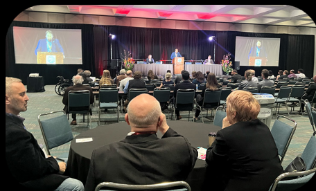
Annual World Congress