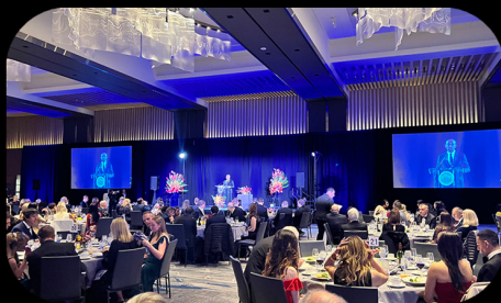
GFC Awards Gala