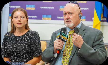
Global Physicians and Scientists

We are proud of our youngest members, therefore we listen to them as we do with our seasoned veterans.