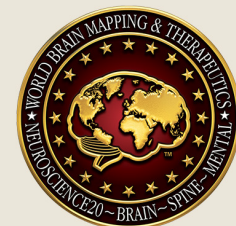
The official N20 seal.