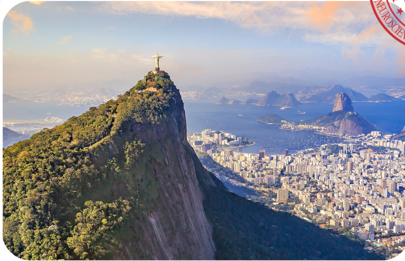
Rio de Janeiro, Brazil

11th Annual N20 Summit (Brain, Spine & Mental Health)