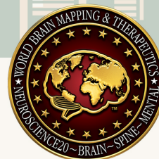
The official N20 seal.