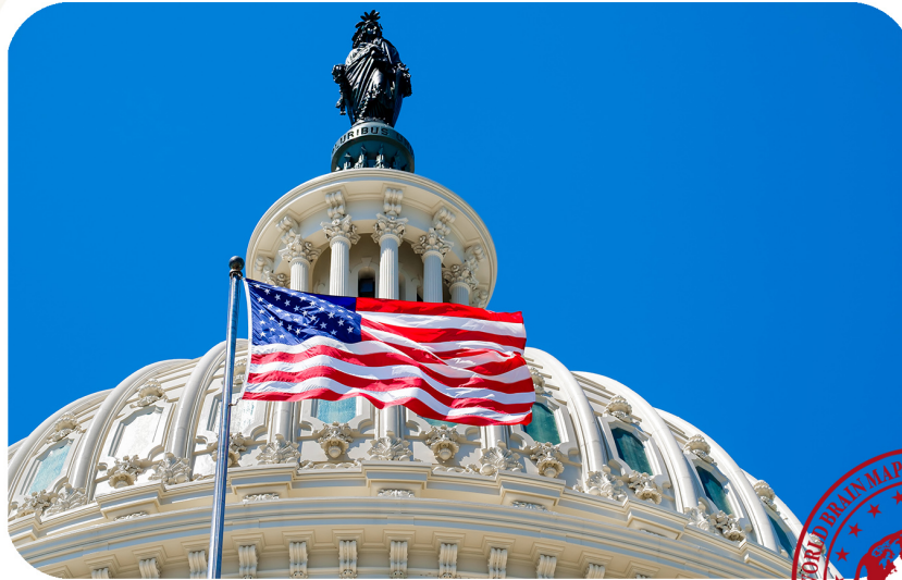
Washington D.C. USA