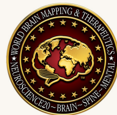
The official N20 seal.