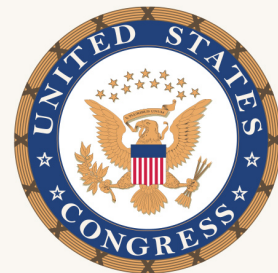
The official US Congress seal.